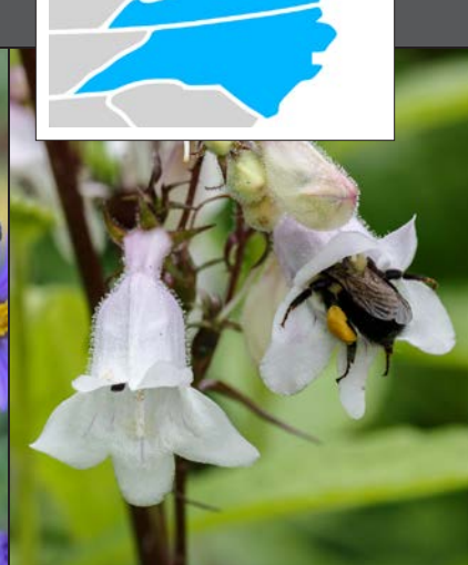
Wingstem, New England aster, and smooth penstemon

The Mid-Atlantic Region encompasses North Carolina, Virginia, West Virginia, Maryland, Delaware, New Jersey, Pennsylvania, and Washington, D.C. High regional variation in topography, soils, and climate has resulted in tremendous ecological diversity, ranging from the salt marshes and wetlands of the eastern Coastal Plain, to the spectacularly species-rich deciduous forests and riparian communities of the Piedmont foothills and Appalachian Mountains.